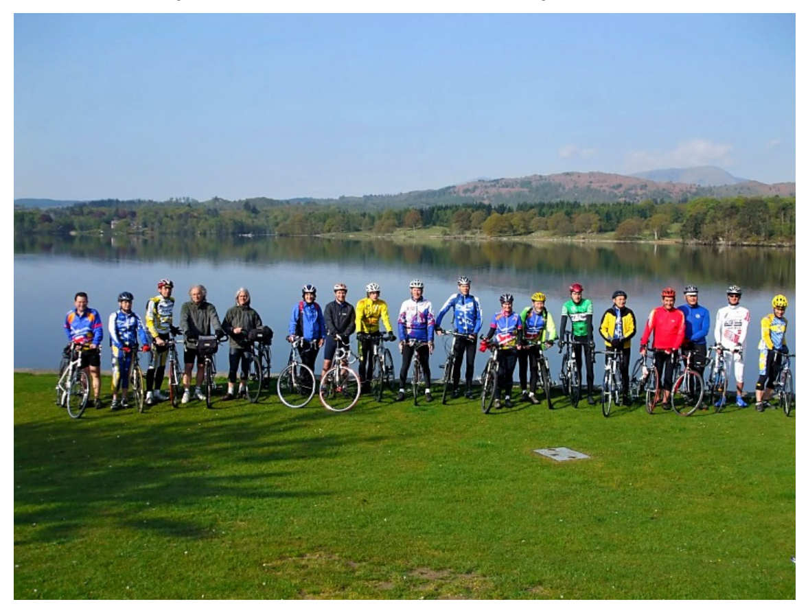
Posing in front of Lake Windermere where the Youth Hostel in Ambleside was located. Beautiful don't you agree?

• The 2010 BIG meeting in the Lake and Peak District in the United Kingdom: